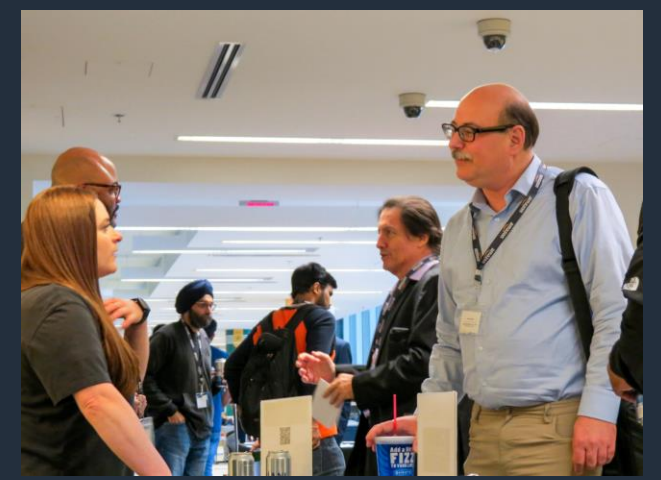
5' tables in the 2023 DMV event

Dedicated tables in sponsor expo for both tiers to engage with the community